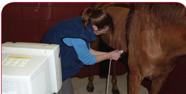
ULTRASOUND EXAMINATION OF THE CHEST CAVITY