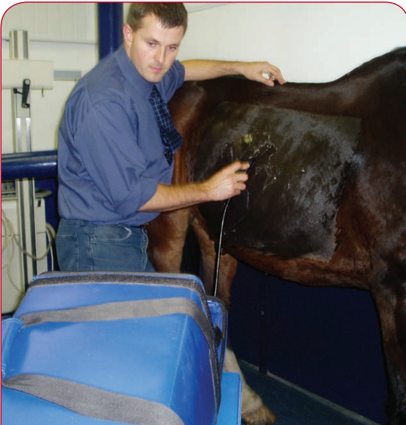
ULTRASOUND IS A USEFUL TOOL IN THE EVALUATION OF CONDITIONS OF THE ABDOMEN AND THORAX