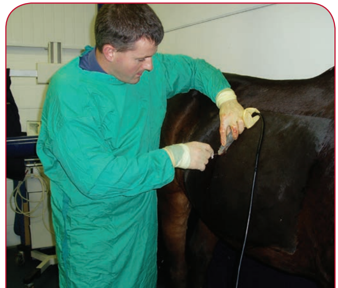
ULTRASOUND GUIDED LIVER BIOPSY